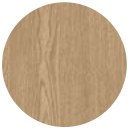
Light Oak LO