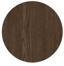
Dark Oak DO