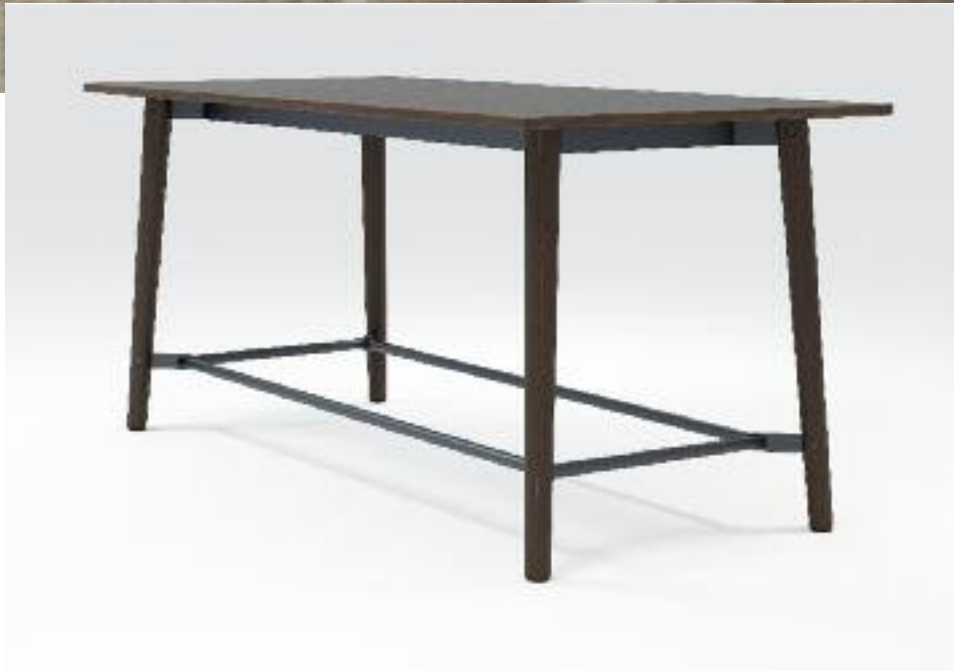
VOODOO Rectangle Tables in café and bar heights