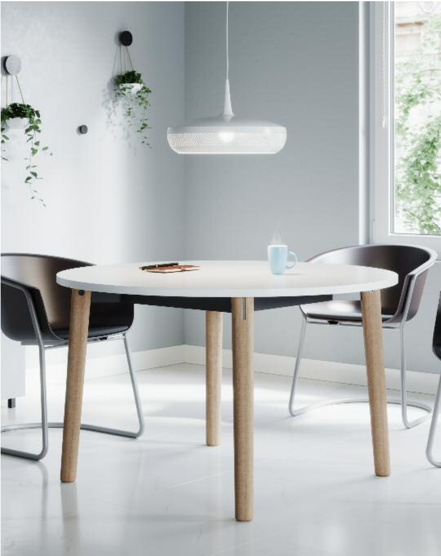
VOODOO 48" Round Table