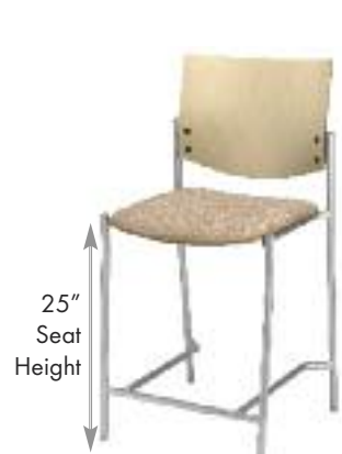
HP1310 - Wood Back