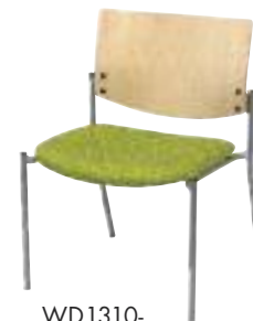
WD1310- Wood Back