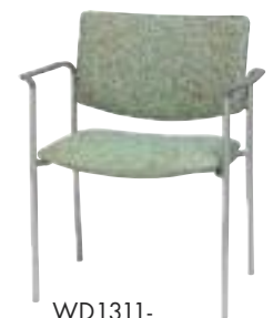
WD1311- Fabric Back