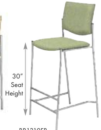
BR1310FB - Fabric Back