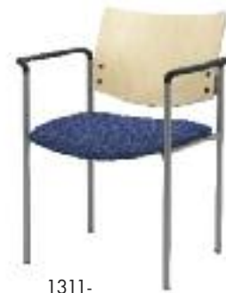
1311- Wood Back