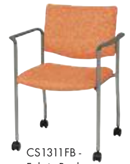
CS1311FB - Fabric Back