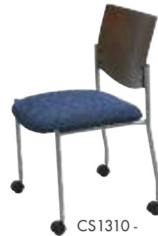
CS1310 - Wood Back