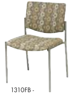
1310FB - Fabric Back